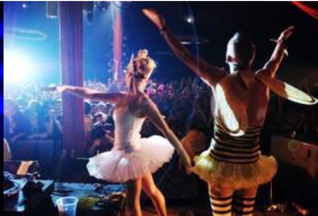
DJ Fat Boy Slim