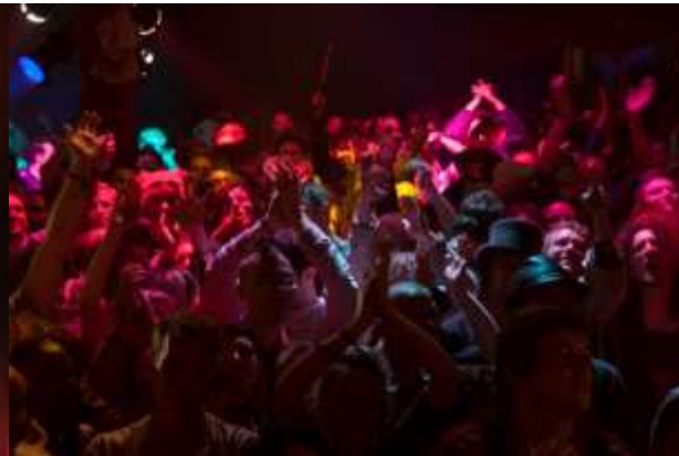
Lost Vagueness crowd