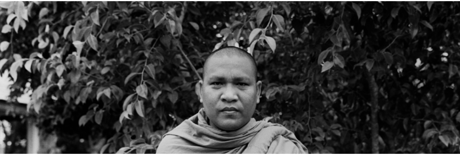
THE VENERABLE LUON SOVATH

“Religion belongs to the government now.”